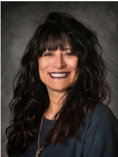
Irene Richardson Memorial Hospital of Sweetwater County CEO